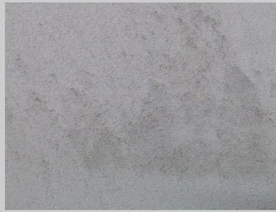
after being cleaned with mould stain remover