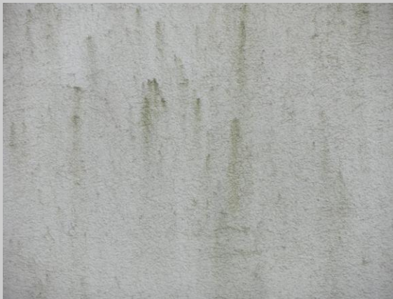
Algae growth on silicate plaster