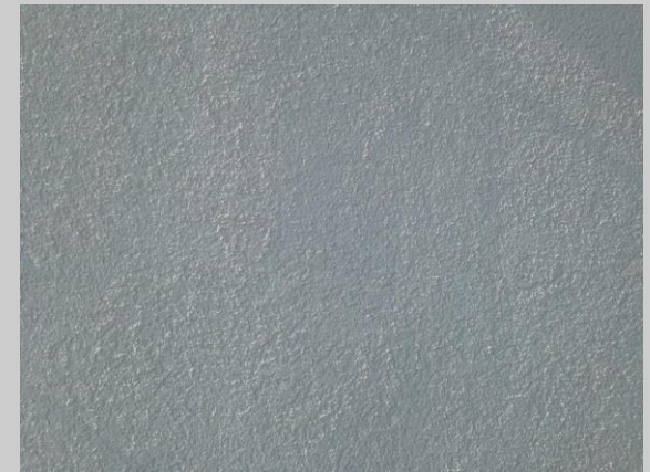
after being coated with KaWaTech

As a result of applying KaWaTech and keeping out water (from heavy rain), the treated facade remains unchanged after two years.